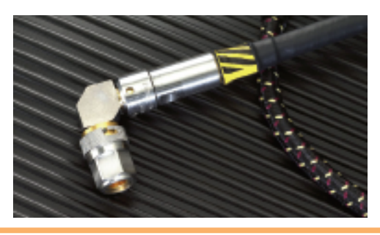
TIMES MICROWAVE SYSTEMS Wallingford, CT

imes Microwave Systems has recently developed an integrated LNA package to allow the location of a low-noise amplifier (LNA) at the antenna, ahead of the cable assembly, in high-performance aircraft. The use of an LNA directly at the antenna is not a new idea. Most satellite receivers take advantage of this technique and the ubiquitous DBS antennas on many homes all have an LNA built into the feed horns. However, what is an easy job for a home receiver becomes a very difficult one for high-performance aircraft, due to size constraints and environmental problems, including vibration.