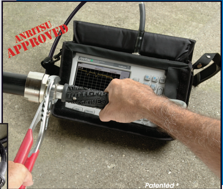
Anritsu SiteMaster™

SilverLine-TG™ (TuffGrip®) test cables are designed for sweep testing cellular infrastructure site cables and antennas. Its unique features were designed by field technicians for field technicians.