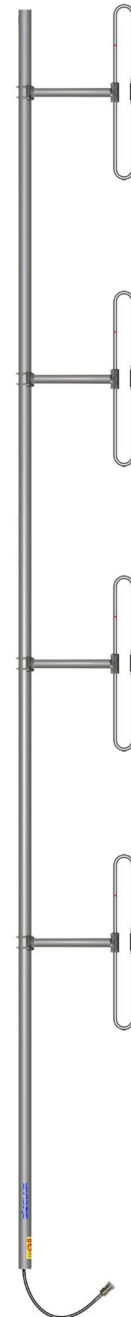
1/4 wave shown

Clamps are not included but recommended is the set of #130 clamps.