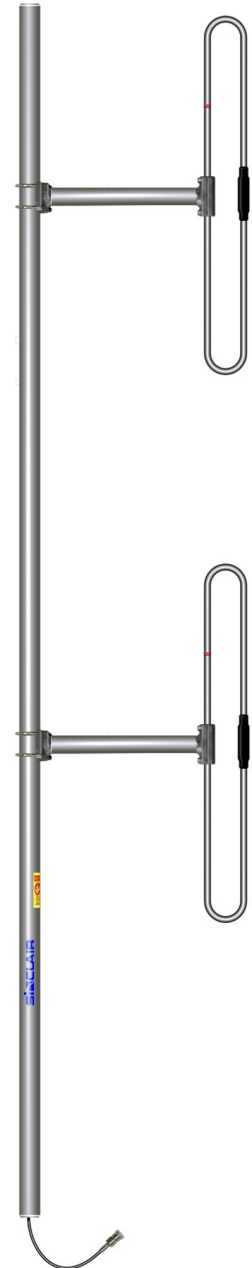
Standard SD212-L model shown.

Clamps are not included but recommended is the set of #6A clamps.