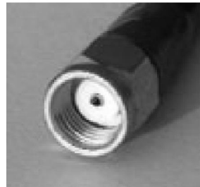
Reverse Polarity SMA Straight Plug Screw Coupling (Code # 17H)