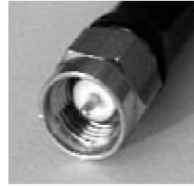
Reverse THREAD SMA Straight Plug Reverse Screw Thread (Code # 17HT)