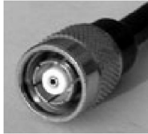
Reverse Polarity TNC Straight Plug Screw Coupling (Code # 24H)