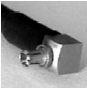
Lucent MC Card Connector Right Angle Plug Push Coupling (Code # 53B) R299792