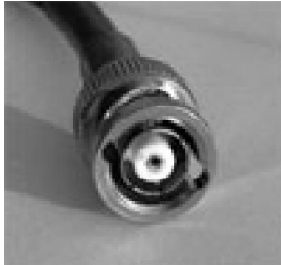
Reverse Polarity BNC Straight Plug Bayonet Coupling (Code # 02H)