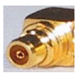
Reverse Polarity MMCX Straight Push-On Plug (Code # 31H)