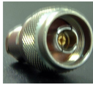
Reverse Polarity N Straight Plug Screw Coupling (Code # 13H)