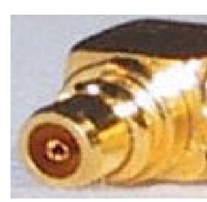
Reverse Polarity MMCX Straight Push-On Plug (Code # 31H)